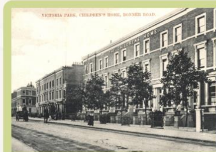
This is a photograph of the Children's Home. It was in Bethnal Green, East London.