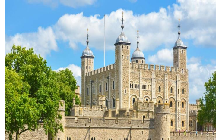
The Tower of London

Bronze Age people lived in simple wooden homes. They built simple farms, where people lived in the same room as their animals for warmth and to protect them.