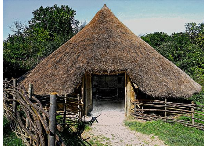
Iron Age houses

These people built temporary homes from wood and animal skins. Stone Age people were hunter-gatherers, who had to catch or find everything they ate. They moved from place to place in search of food.