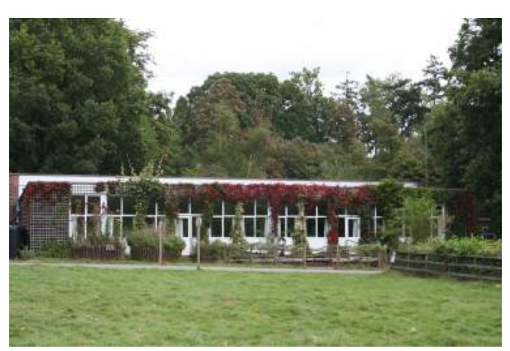
Cleaned and maintained everyday Secure, private grounds