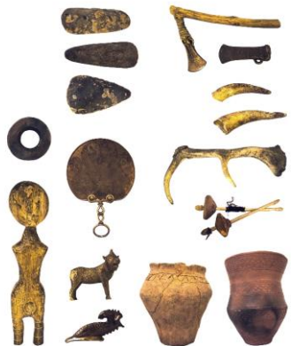
Some Stone Age, Bronze Age and Iron Age tools.

Next half-term, Year 3 are going to be learning all about the Stone Age , Bronze Age and Iron Age in our History learning. We will be learning about each Age separately, before thinking about the differences between the three and the impact they had on more modern life.