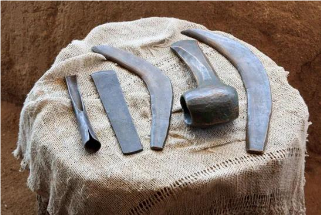
People used bronze to make tools during the Bronze Age.