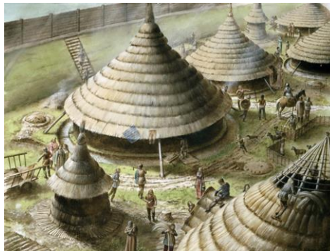
People lived in round houses during the Iron Age.