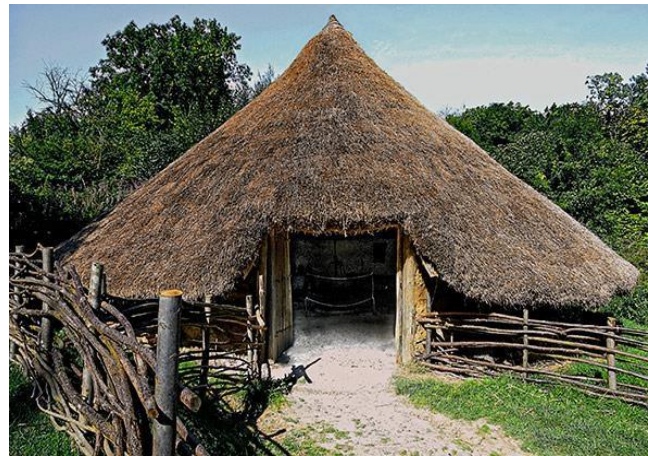
Bronze Age houses

These people built temporary homes from wood and animal skins. Stone Age people were hunter-gatherers, who had to catch or find everything they ate. They moved from place to place in search of food.