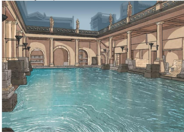
An image of Roman public baths.