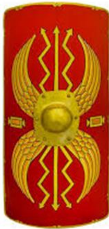
An image of a Roman shield used in battles.