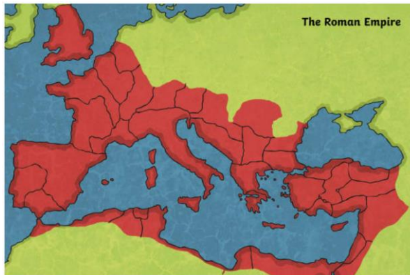
A map showing the countries in the Roman Empire.

Next half-term, Year 3 are going to be learning all about the Romans in our History learning.