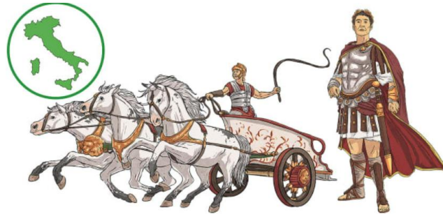
A small map of Italy, where the Romans originated from.

Don't forget to complete your project too!