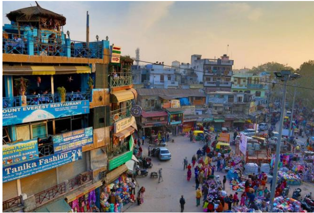
An image of New Delhi.